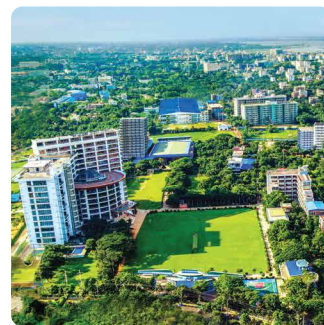
Day 3: Daffodil Smart City, Birulia