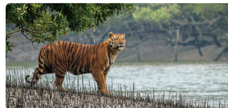
Visiting the Sundarbans (by helicopter)