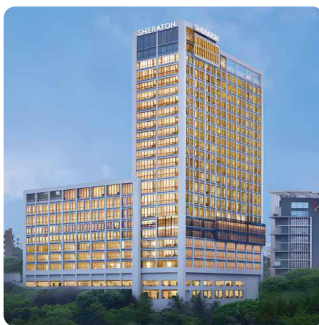
Day 2: Hotel Sheraton, Dhaka