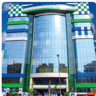
Day 1: Daffodil Plaza, Dhaka