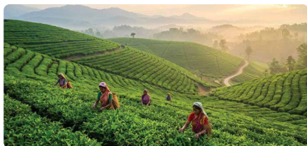
Tea Gardens in Jaflong (by helicopter or flight)